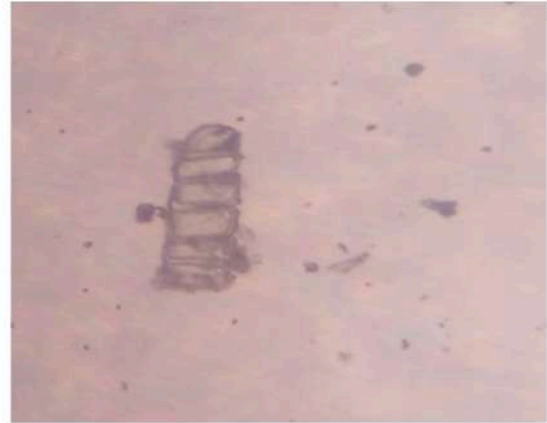
Figure 6: Multiseriate trichome fragment