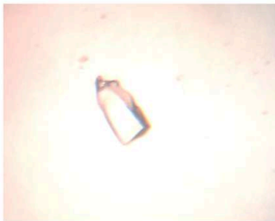
Figure 7: Prismatic calcium oxalate crystal