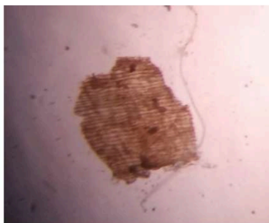
Figure 3: Group of fusiform sclerides