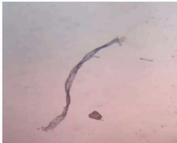
Figure 9: Fiber