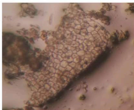
Figure 2: Epicarp in surface view