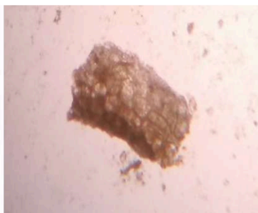
Figure 4: Thick walled endosperm