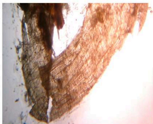
Figure 1: Mesocarp in surface view