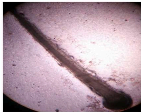
Figure 8: Covering trichome