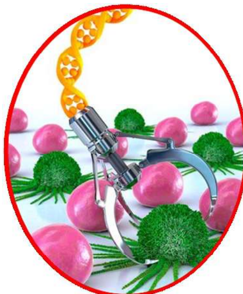
Figure.2 Gene Therapy