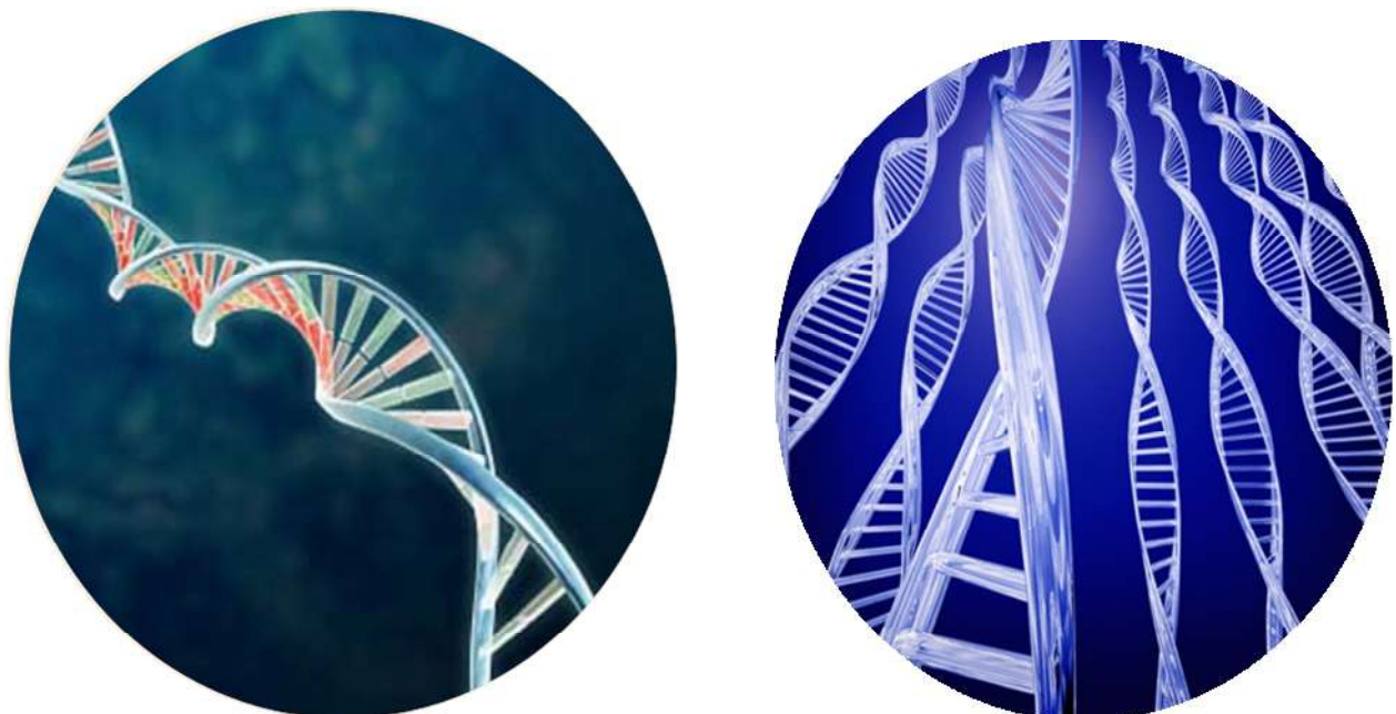
Figure.1 Gene Structure