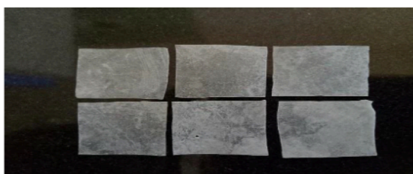
Figure 1: Desired shape of sublingual film